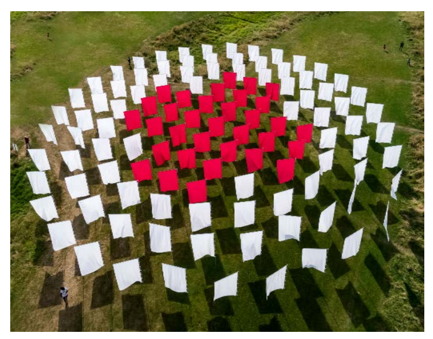
In Memoriam

Check the <u>DSES News and Events page</u> for all of the latest news stories.